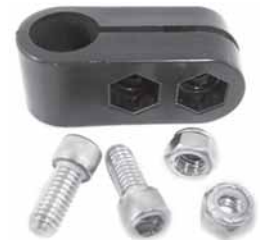
Black Nylon Clamp 3/4" O.D. Tubing Product # M60748416