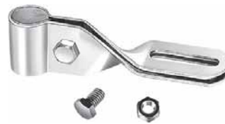
Stainless Twist Clamp 3/4" O.D. Tubing Product # M60704065