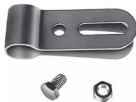
Stainless Flat Clamp 3/4" O.D. Tubing Product # M60704066