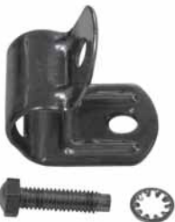
Stainless 3/4" O.D. Tubing Product # M60704068